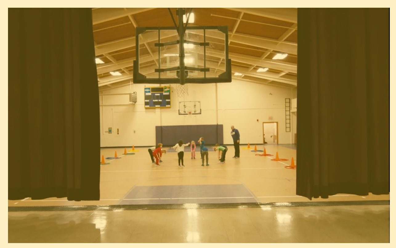
Trauma Sensitive School Initiative

to determine whether it's a good fit. The organization even overhauled its hiring process based on its values, making sure every interview question matches up with one of its five principles. More than a statement on the wall, CREA's values are like a rallying cry — a point of commonality that grounds decision-making, bonds staff together and orients everyone in a similar direction.