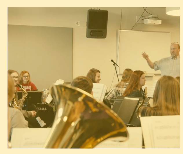
Social Emotional Learning Initiative