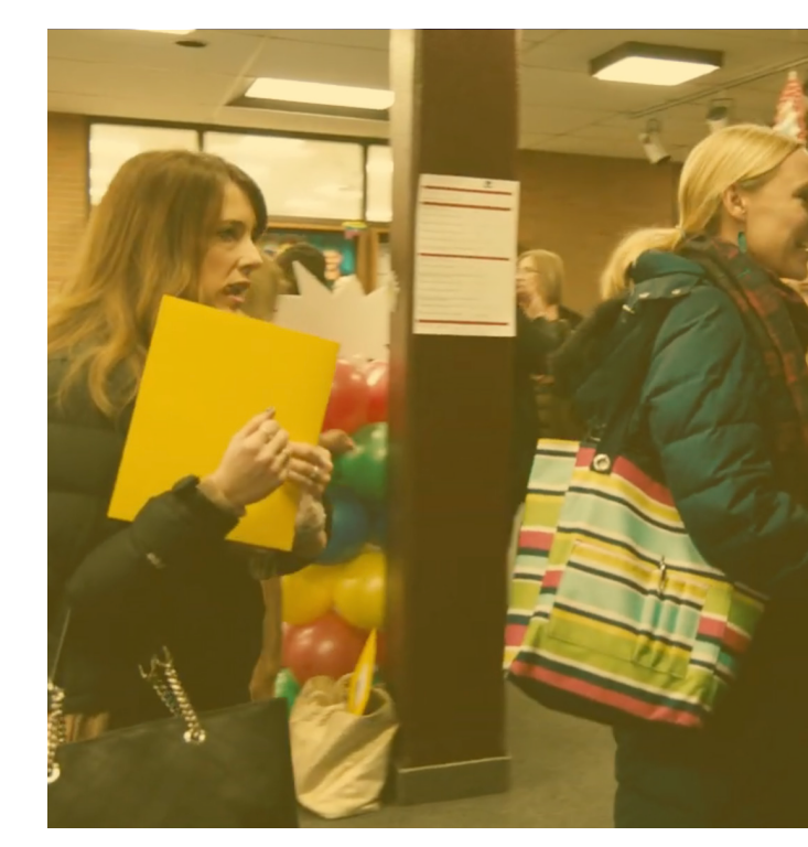
Meeting School Needs