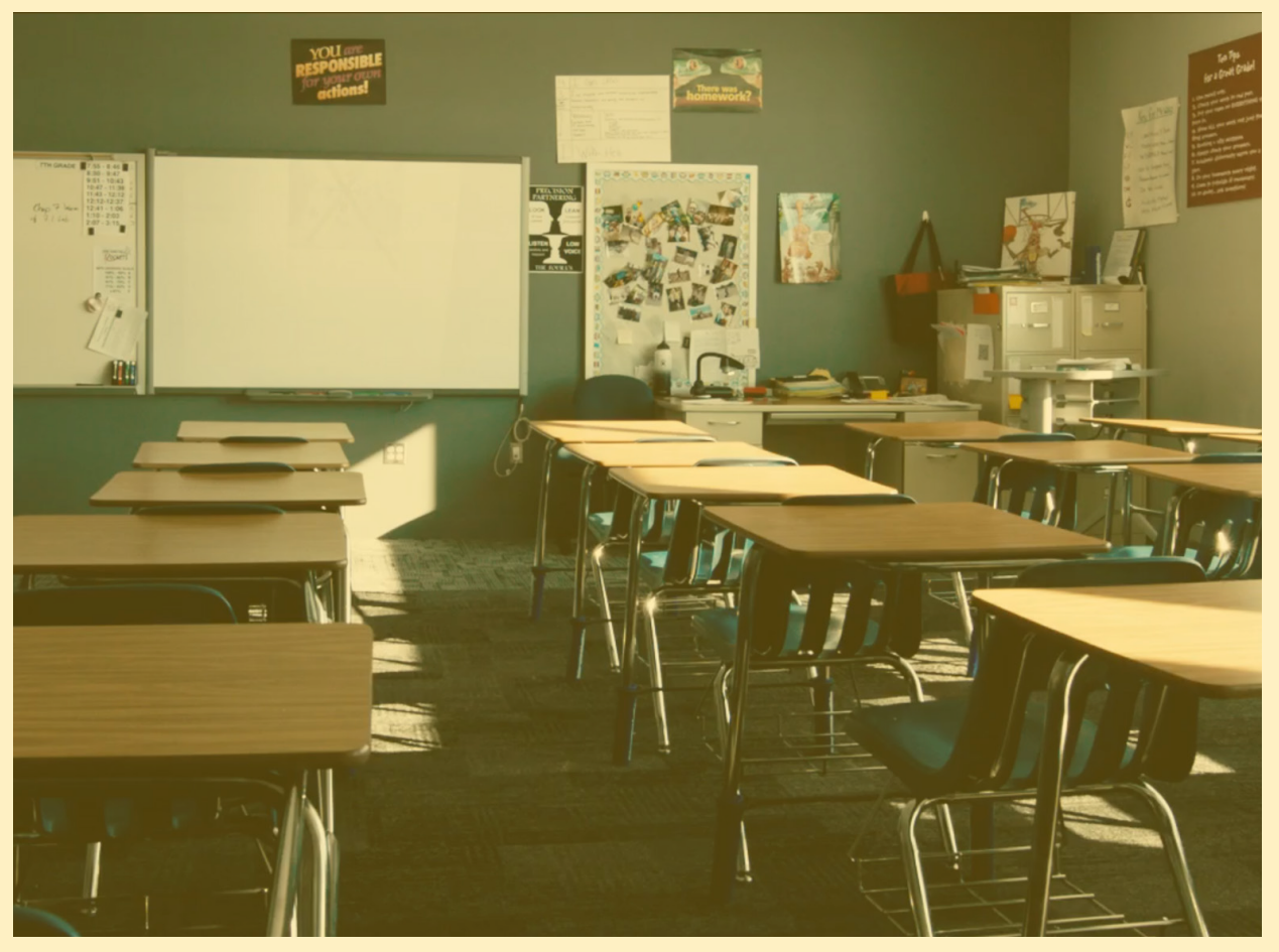
Enhancing Opportunities in 15 School Districts