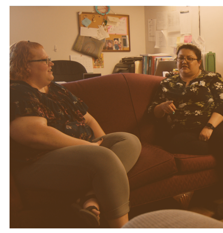
Capital Area Counseling Service Offices