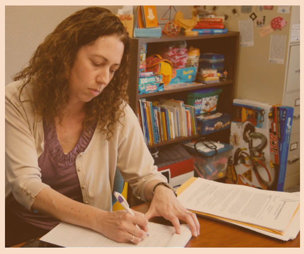
Capital Area Counseling Service Offices