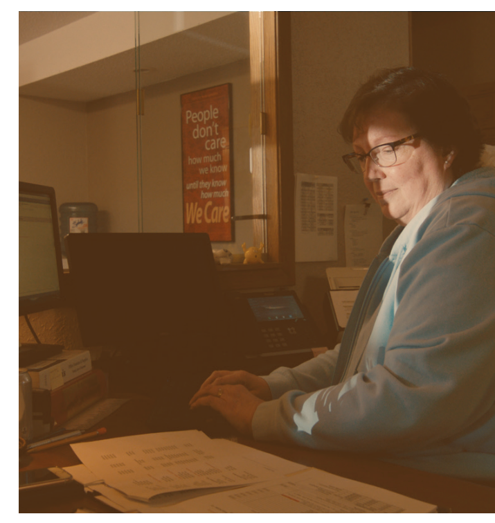
Capital Area Counseling Service Offices