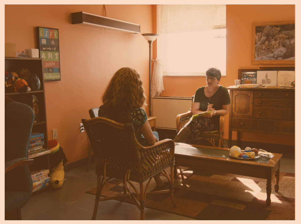
Building Personal Relationships