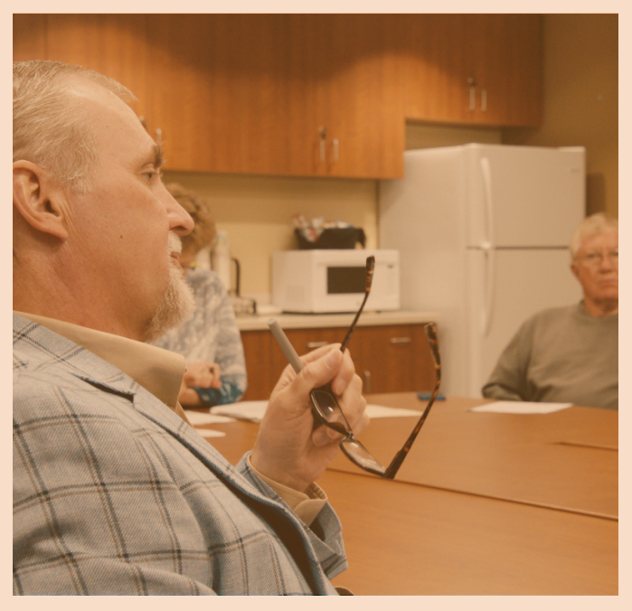
Pierre/Fort Pierre Mental Health Task Force