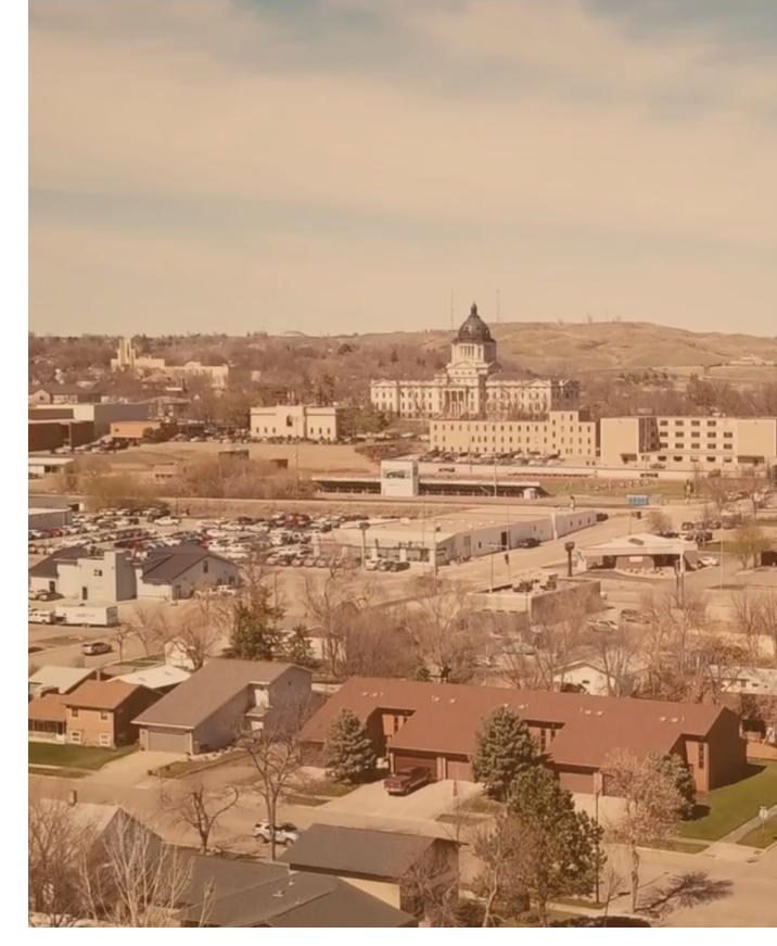
Pierre, South Dakota