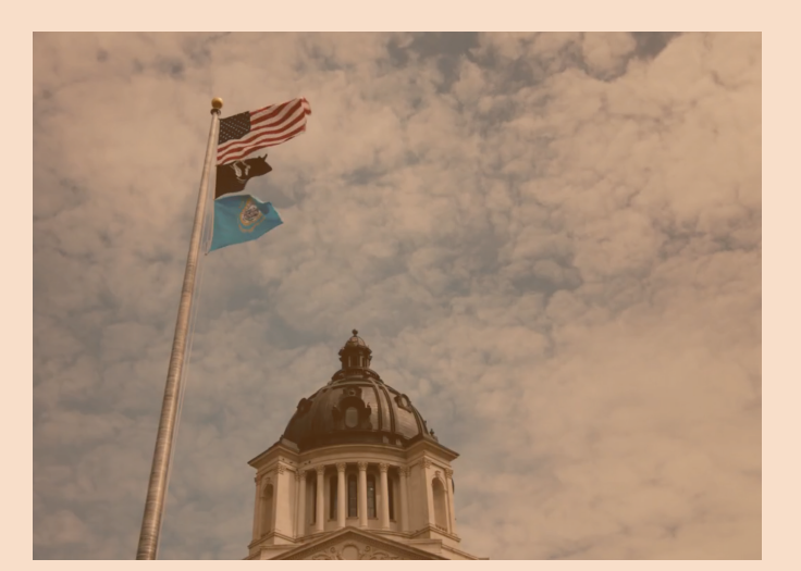
Mobile Crisis Response