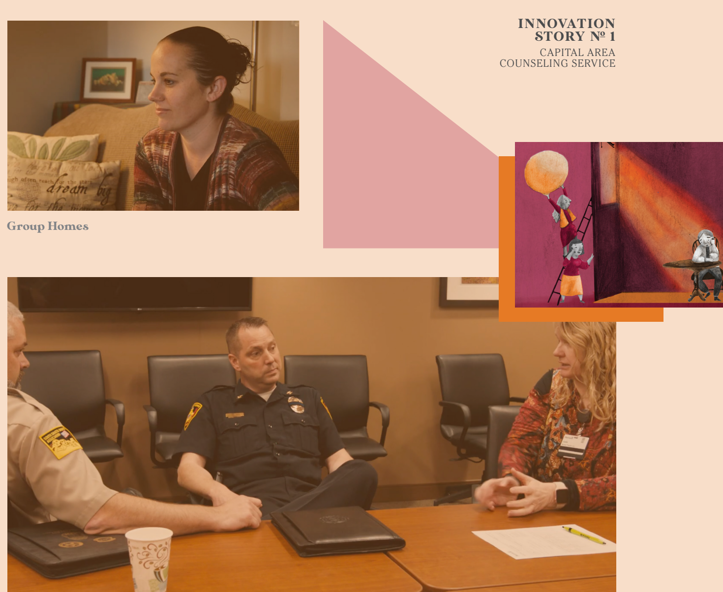
Pierre/Fort Pierre Mental Health Task Force